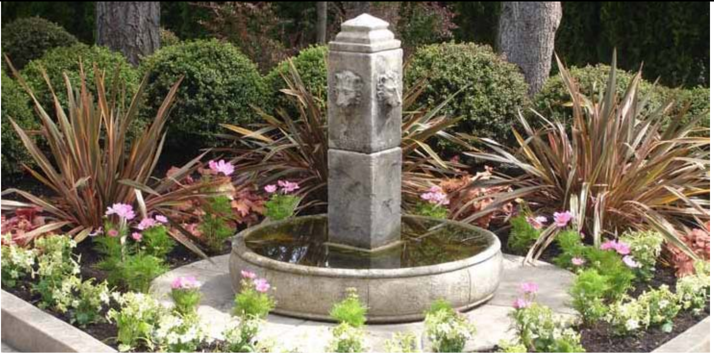
The entry fountain is highlighted with pink stripe flax in the background and annuals in the foreground.

Pacific Earth Works Pulls Together A Collaborative Team and Pulls Off An Impressive Project